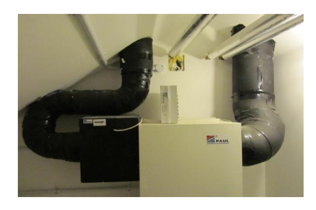
Fig 2. Passivhaus design specifies vapour retardant insulation, to prevent condensation forming inside or outside the ventilation ducts

Another concern that exists relates to the possible spread of particulates arising from dust or dirt within the ductwork. The primary cause of debris within the ductwork arises during the construction process; this is an issue that is currently overlooked by Building Regulations in England and Wales. Of the 18,000 or so MVHR units installed in UK buildings last year<sup>1</sup>; the majority were not in Passivhaus buildings. While no research has been done into the quality of most installations, the Certified Passivhaus Designers and Consultants have been trained to supervise the construction process so as to maximise the cleanliness of the ductwork. With good standards of quality assurance, ducts will be protected during construction to prevent them being coated with builders' dust; and if they do get dirty then they should be cleaned.