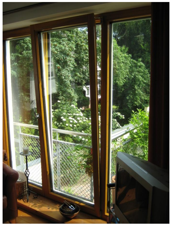
Fig 1. Passivhaus occupants are free to enjoy the scents and sounds of outdoors

As a matter of fact, in warm weather Passivhaus occupants are encouraged to open their windows. In the height of summer it is advantageous to naturally ventilate during the night-time as it offers greater potential for cooling. Then, in the morning, the windows can be closed again, to hang on to the refreshing free coolth inside, while everyone else is sweltering outside.