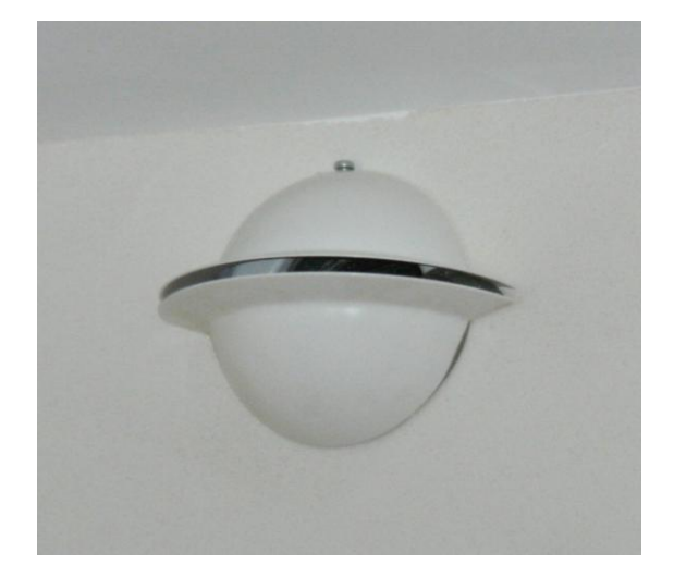
Fig 3. Ventilation outlet in a Passivhaus – the air moves over the ceiling before gently mixing with the air in the room

This concern arises from the fact that when you hold your hand to the air supply grille, air movement can be felt. Research by Olaf Fanger helped to develop our understanding of thermal comfort, and established that the threshold at which discomfort from draughts may be felt is about 0.1m/s. By positioning the air inlets and outlets close to the ceiling it is possible to exploit the coanda effect, whereby the aerodynamics of moving air means that it temporarily clings to the ceiling before gradually falling and mixing with the other air within the room. Measurements in Passivhaus buildings have shown that the velocity of moving air within the normal habitable zone is well below the threshold of discomfort.