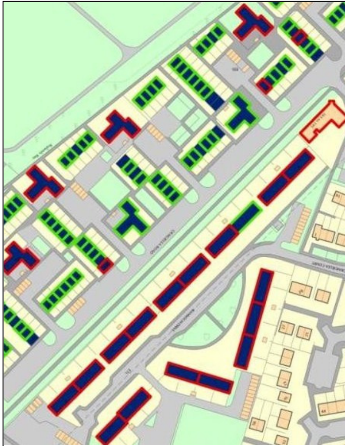
Figure 4: Council stock, RTB, and Local Housing Allowance (red)

Finally, Figure 5 identifies with a yellow dot all the PRS registered stock (1 st March 2012). What is interesting here is that we can identify both registered PRS stock not subject to LHA claim (yellow arrow, in this case not RTB stock but part of the mapped area), but also PRS stock with an LHA claim that is not registered (red arrow). This indicates that there is likely to be a considerable untracked PRS at the lower end of the market even in Scotland where registration as a landlord is compulsory.