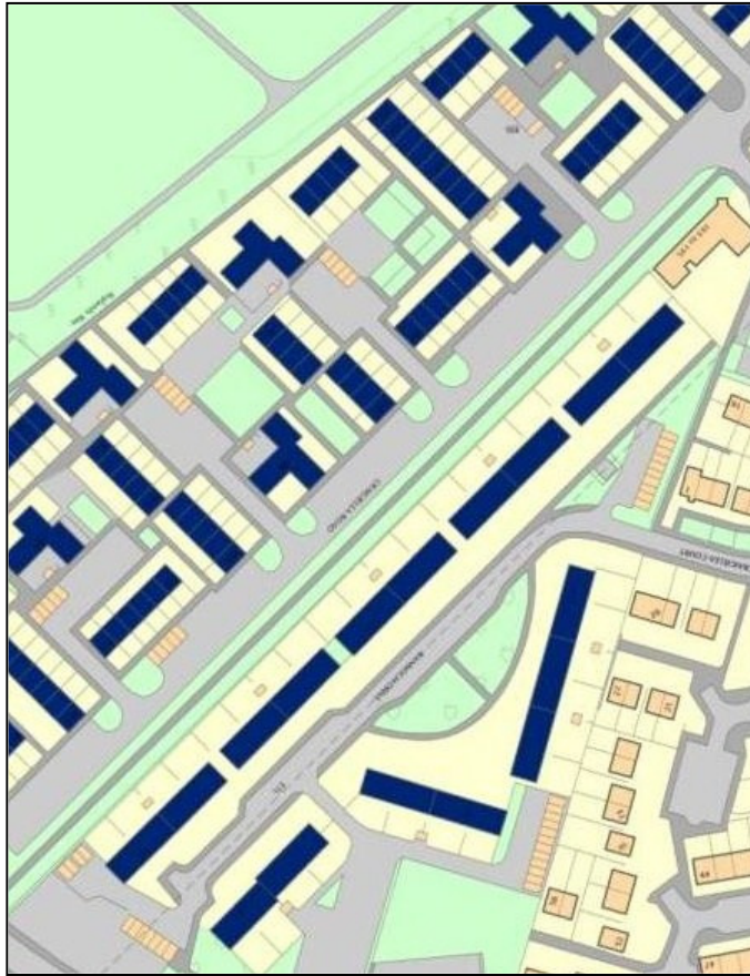
Figure 2: Property map and original council stock (blue)